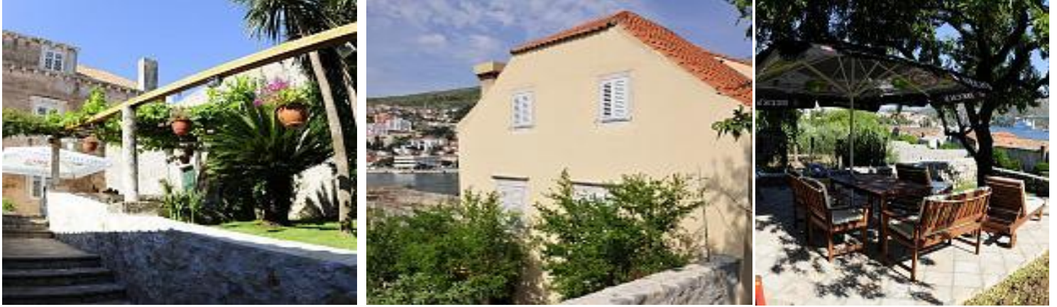
Photos around the property