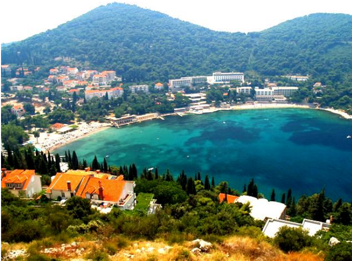
Bay of Lapad

Sleeps 10 + 5 | 4 Double Bedrooms, 1 Studio with Double Bed, 5 Single Sofa Beds | 5 Bathrooms | Pool 4 x 1 Bedroom Apartments (2+2) & 1 x Studio (2+1)