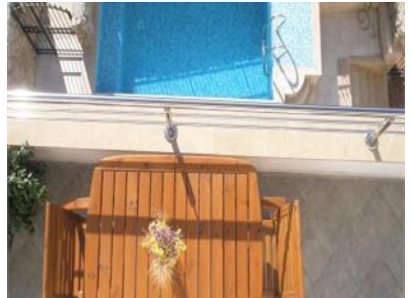
Special attention to detail is given by the owners