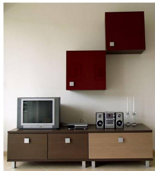
Living room in one of the apartments