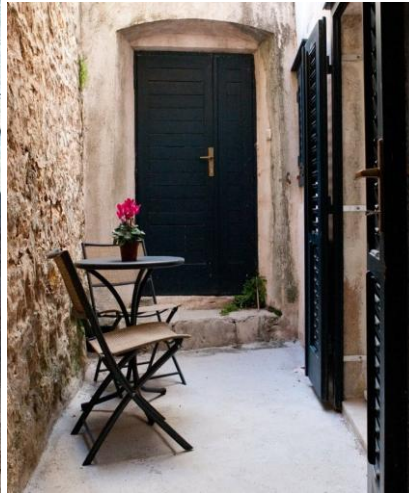
Outside Seating area.