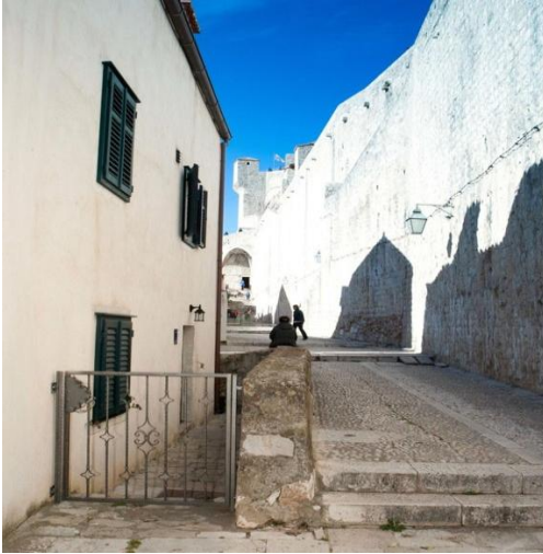
Entrance to apartment.

Sleeps up to 2 | 1 Double Bedroom | 1 Bathroom