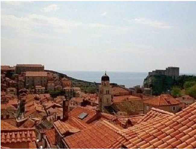
View over the rooftops

The Old town is full of steps so might not be suitable for the elderly or with mobility problems