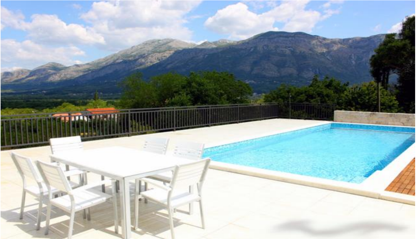
Looking across the pool to Konalve countryside

Sleeps 6 | 3 Double Bedrooms | 3 Bathrooms | separate WC