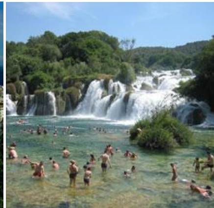
Krka National Park