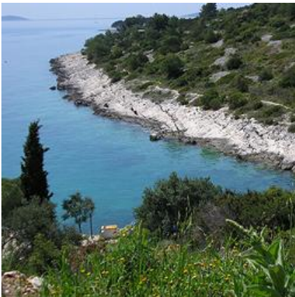
Hidden bay on Ciovo island