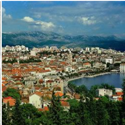
Split Old Town