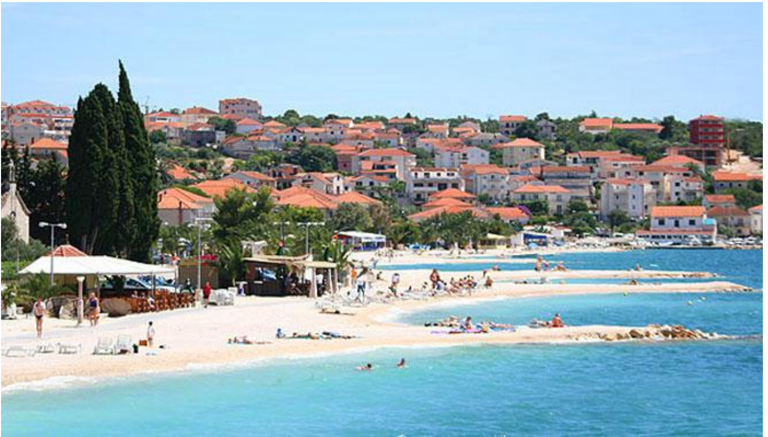
Okrug Gornij Beach (the apts are 100m back from this beach)