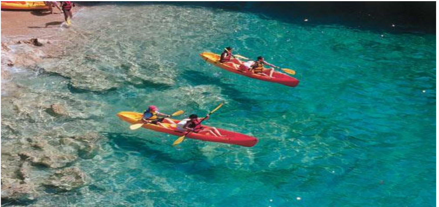
Kayaking off the beach

To book please call us on 0044 (0) 117 9732643 or email us on info@croatiagems.com .