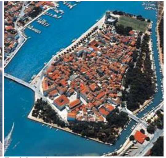
Trogir from above