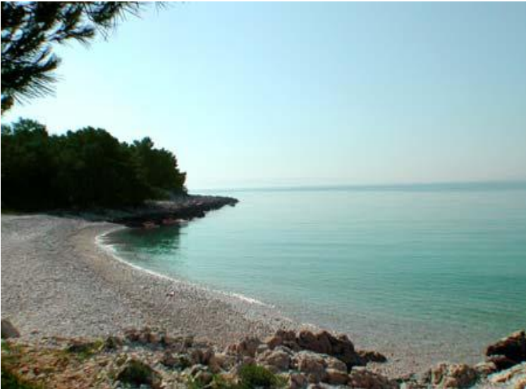
Other Ciovo Beaches & Beach Bars