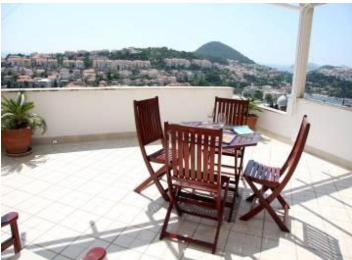
One of the terraces – Views to Lapad Peninsula