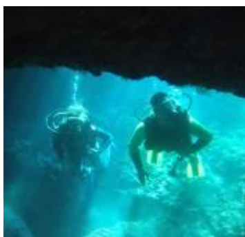
Diving off the coast