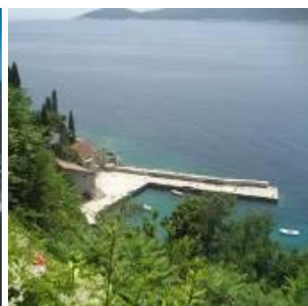
Beautiful Botanical Gardens

To book please call us on 0044 (0) 117 9732643 or email us on info@croatiagems.com .