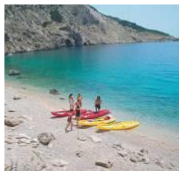
Sea Kayaking to nearby islands