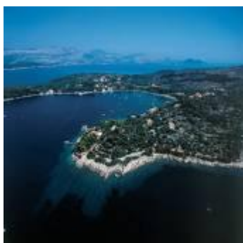
Island of Kolocep 20 mins away!