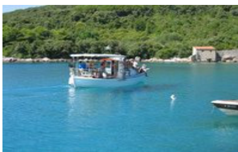
Beautiful turquoise, calm sea in the bay

To book please call us on 0871 8551031 from the UK or 0044 (0)1291 680012 from outside the UK or email us on info@croatiagems.com .