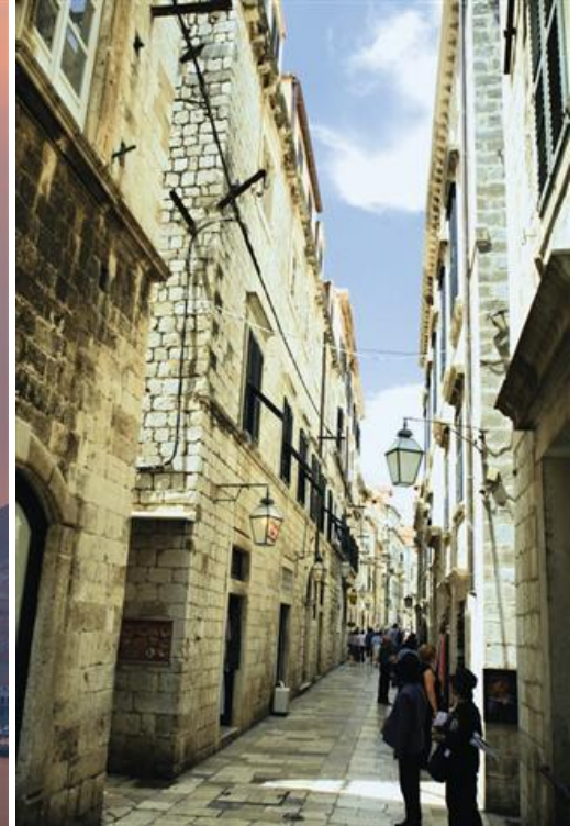
Old Town street

To book please call us on 0044 (0) 117 9732643 or email us on info@croatiagems.com .