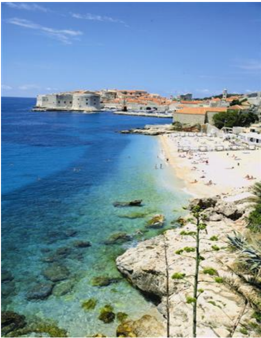
Banja Beach & Old Town of Dubrovnik