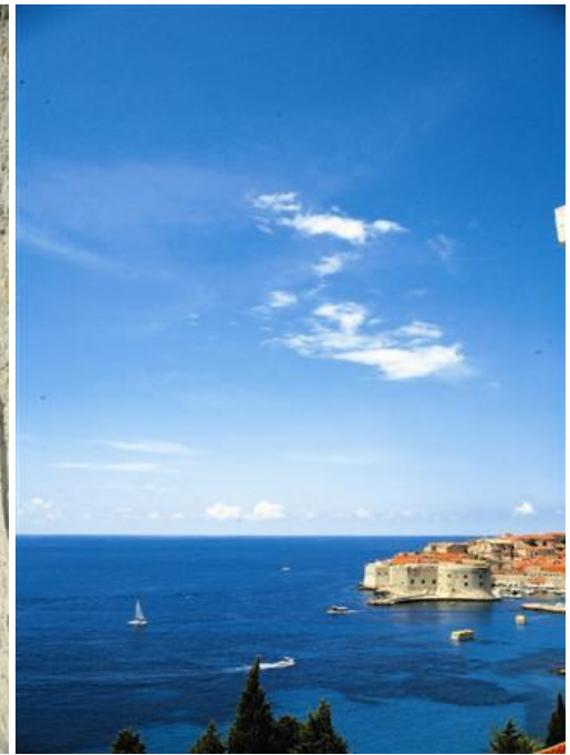
Out to sea