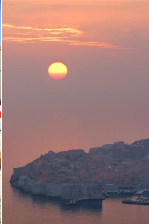
Sunset over Old Town