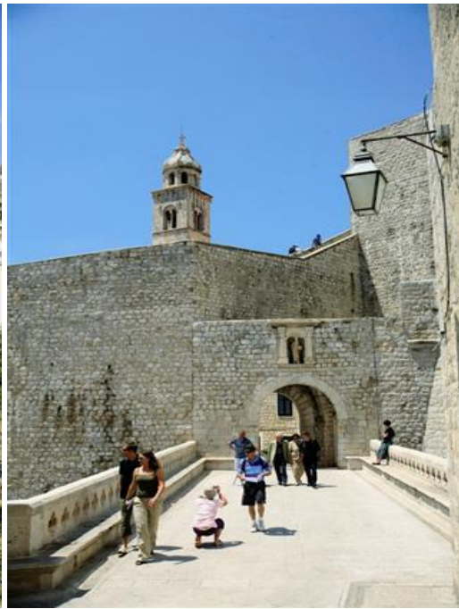
Ploce Old Town Entrance