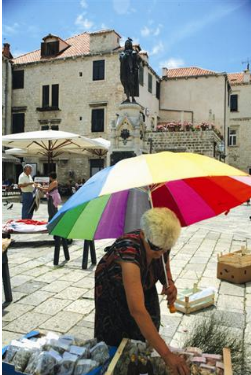
Fruit & Vegetable Market in the Old Town