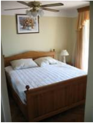
Double Bedroom with Balcony