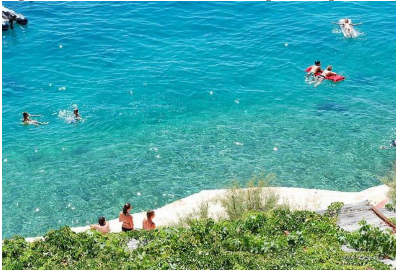
Ciovo Island Beach