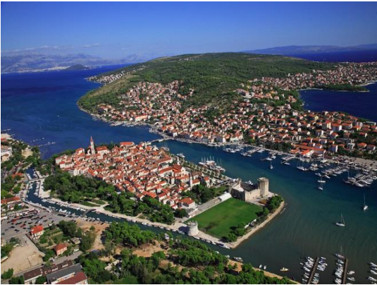
Trogir Medieval Town