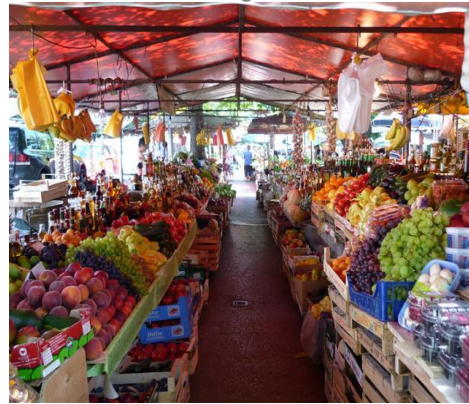
Trogir fruit & veg market