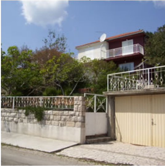
Lemon Tree Villas

Sleeps 4 & 14 | 2 Bedrooms & 7 Bedrooms villas