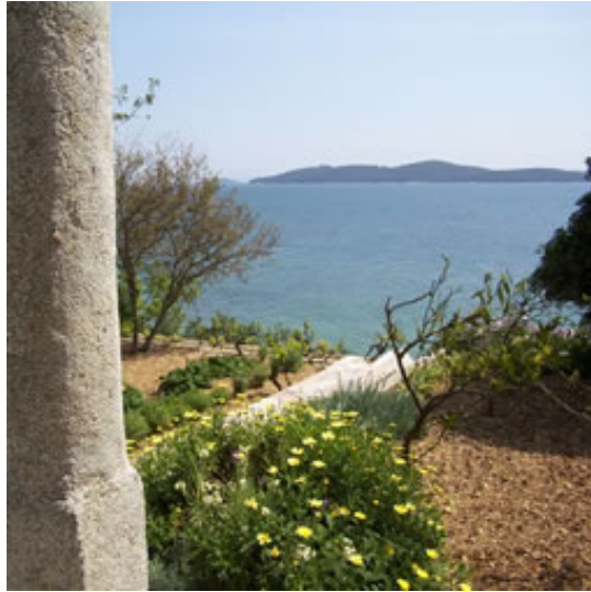
View from villa