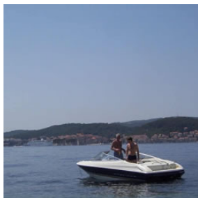
Outside the villas