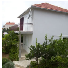
Orange Tree Villa