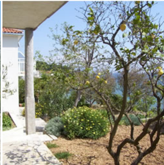
Lemon trees in garden