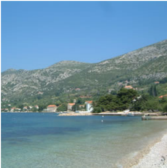
Fishing villages along the coast