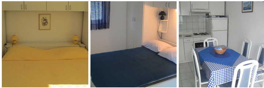
Rooms in Lemon Tree Villa