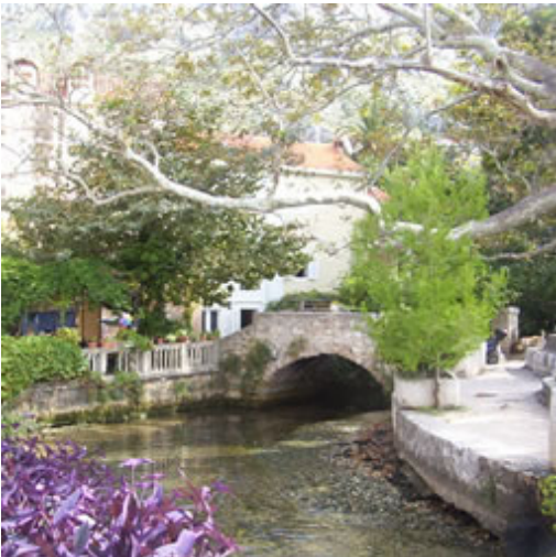
Streams in the village from the old mill