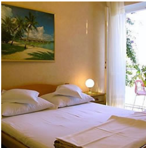
Example bedroom leading to balcony