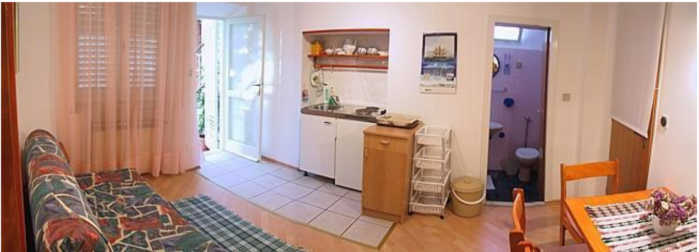
Example Room Layouts