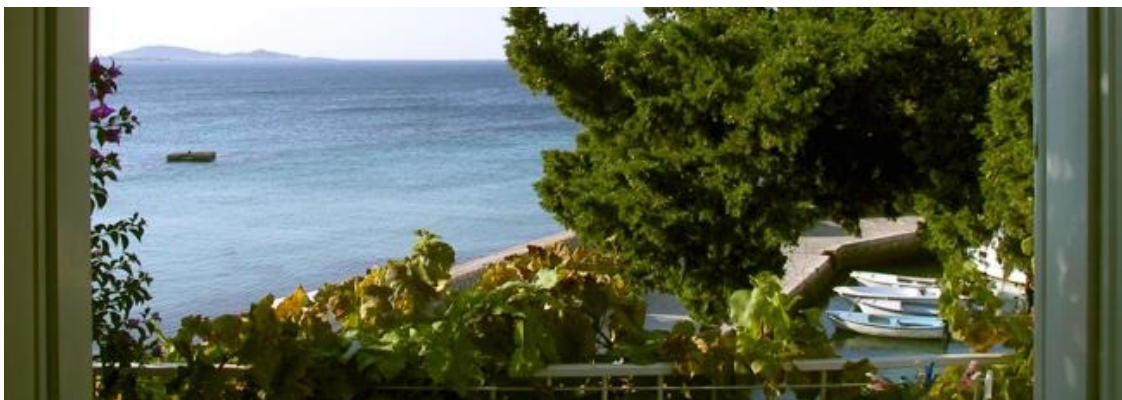
View from one of the balconies

Mlini is a very pretty and peaceful little fishing village just 10 minutes drive outside the beautiful old town of Dubrovnik. Mlini is protected by high mountains, and pine, cypress and olive trees surround the bay - it is very attractive village with a little harbour and a lovely old stone houses with terracotta roofs. Little cafes and restaurants, all situated close to the villa, are perfect for watching the sun go down in and, of course, for enjoying freshly caught fish and local wine! Mlini also has wonderful pebbly and rocky beaches with calm, clear water to revive your spirits... Other available activities in Mlini include sailing, scuba diving, water-skiing, and hiking. And if you've had enough of rest and relaxation there are regular boats and buses to Dubrovnik Old Town as well as to the nearby town of Cavtat.