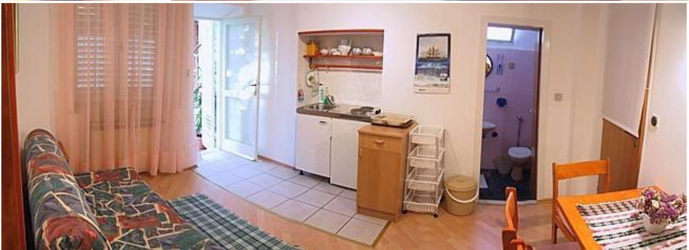
Example Room Layouts