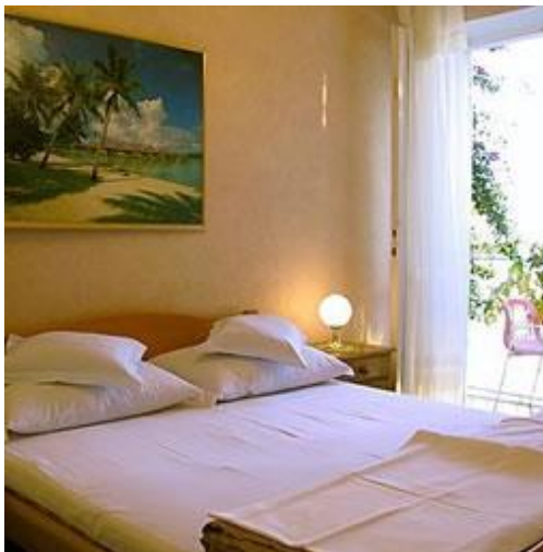
Example bedroom leading to balcony