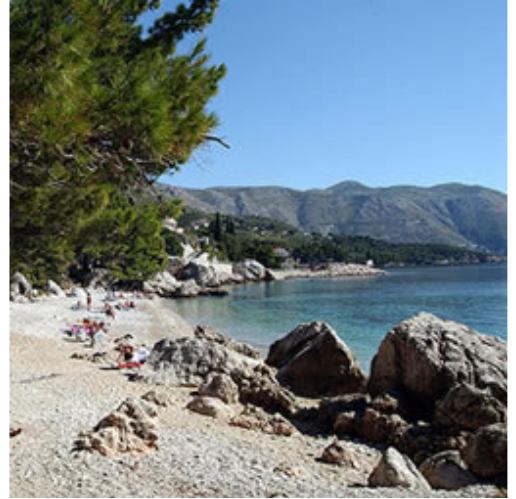
One of Mlini's beaches