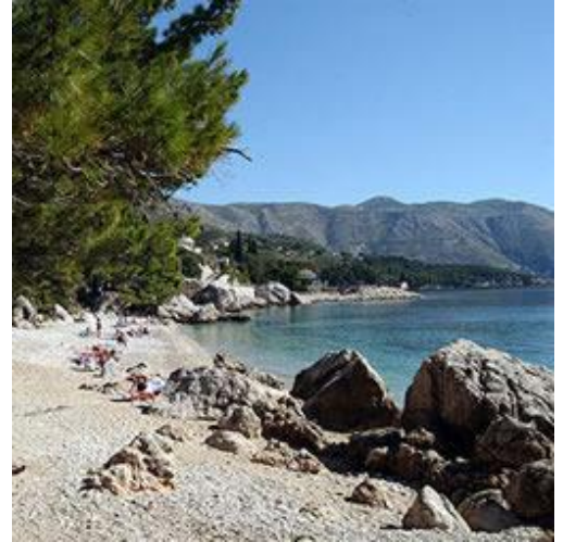
One of Mlini's beaches