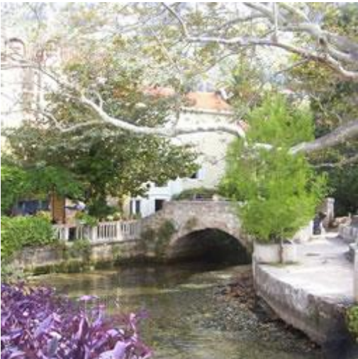
Streams in the village from the old mill