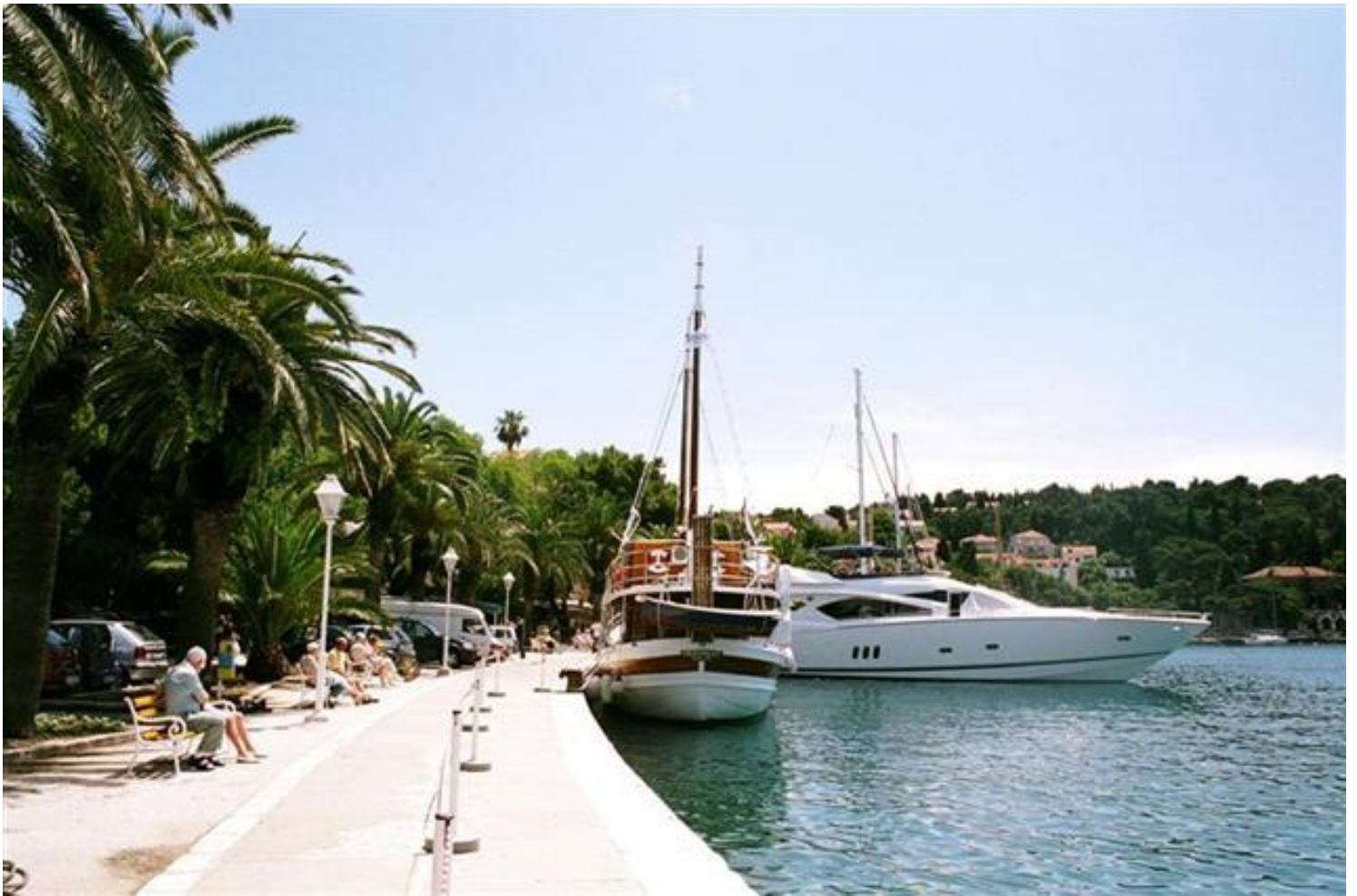
Cavtat – around the bay