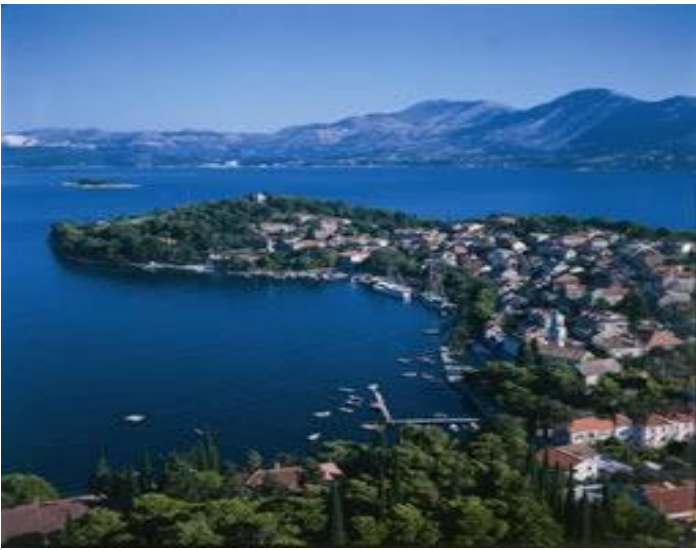
Cavtat from above