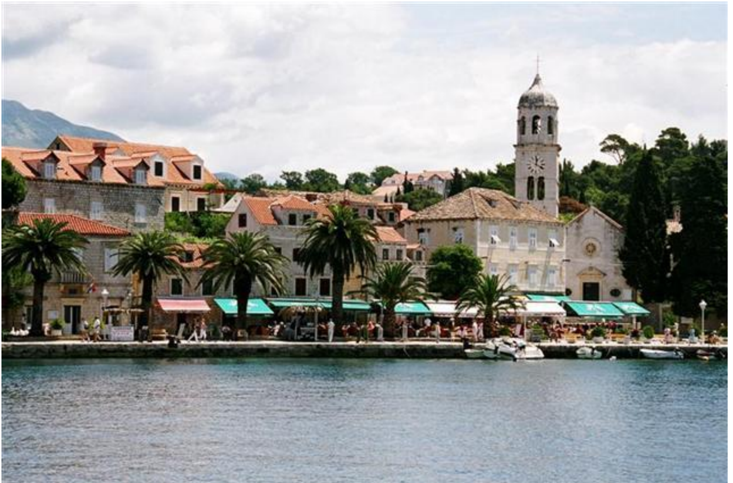
Cavtat – café bars in the bay