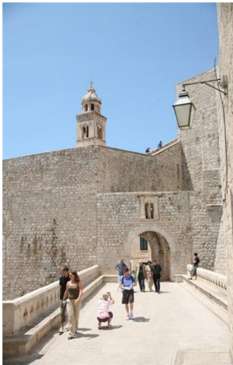
Old Town of Dubrovnik fortified walls