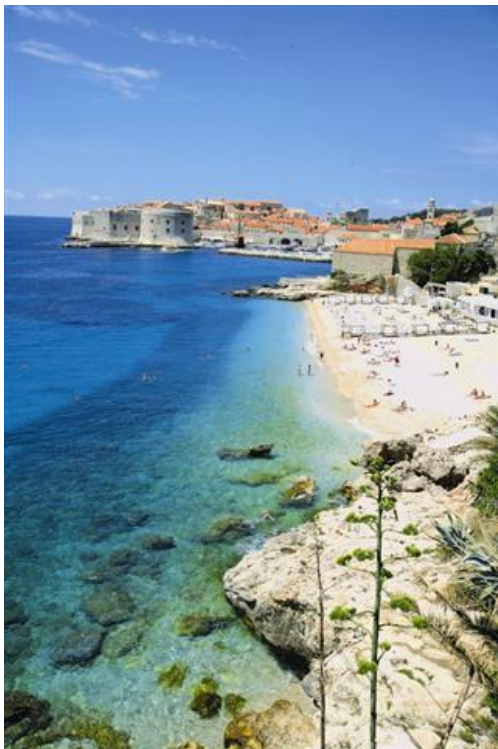
Banja Beach next to the Old Town of Dubrovnik