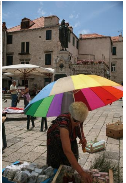
Fruit & Vegetable Market in the Old Town

To book please call us on 0044 (0) 117 9732643 or email us on info@croatiagems.com .