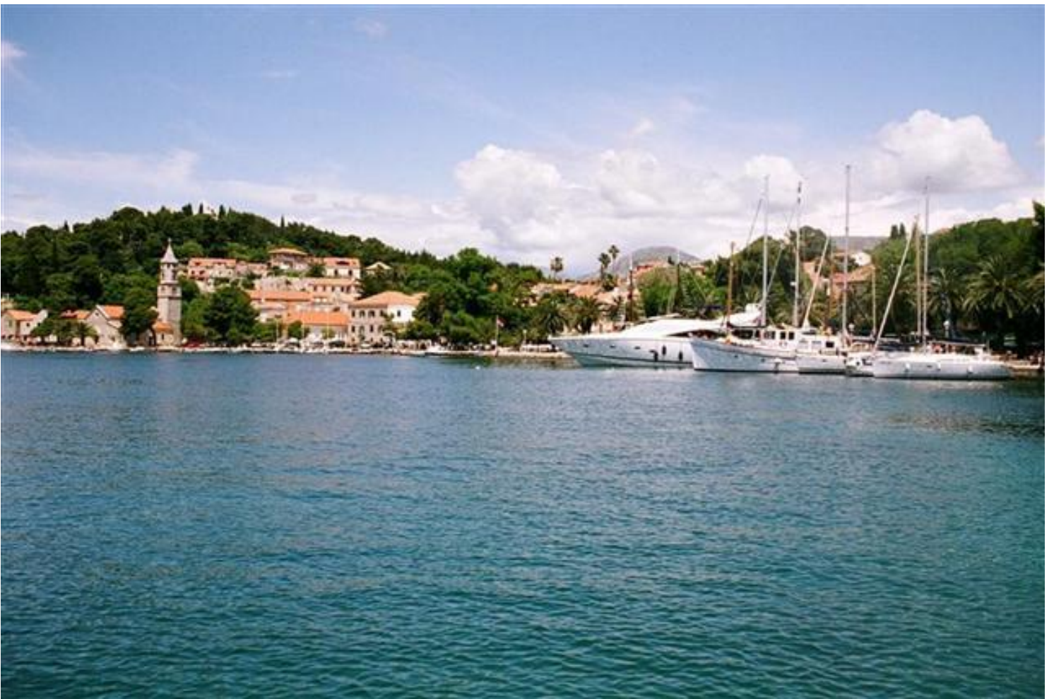
Cavtat – boats mooring in the bay