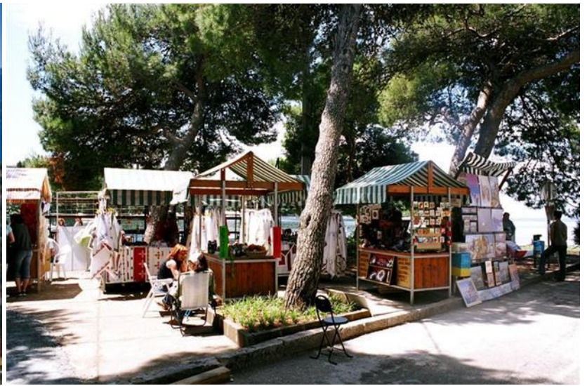
Cavtat Market on the Waterfront