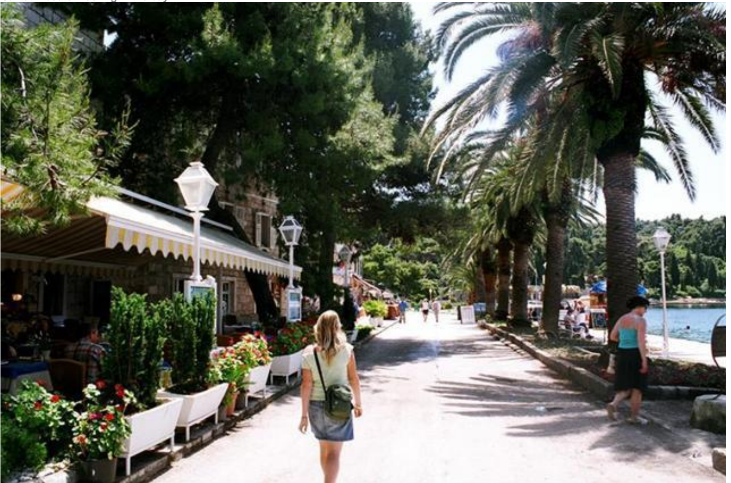
Cavtat – promenade which goes all around the bay