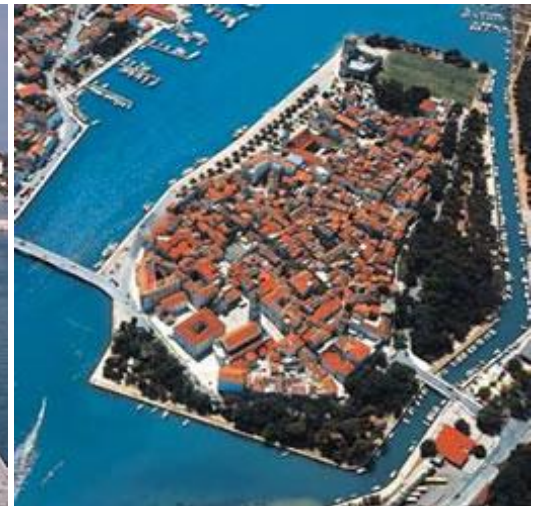
Trogir from above!