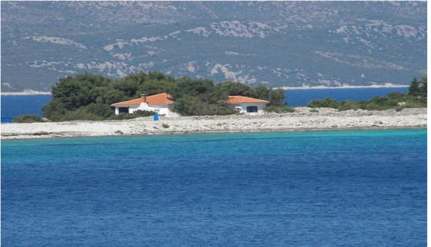
View of the house from the sea