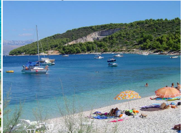
Slatine Beach (Ciovo Island near villa)

To book please call us on 0044 (0) 117 9732643 or email us on info@croatiagems.com .