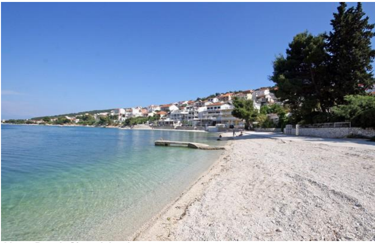
Okrug Beach Ciovo Island