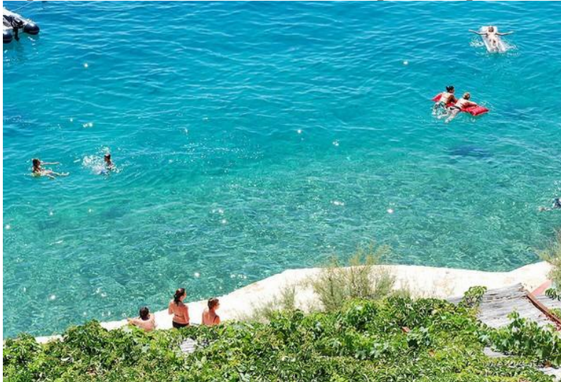
Ciovo Island Beach