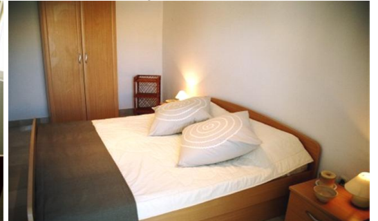
Bedroom 3 (large Balcony & stairs to roof terrace)