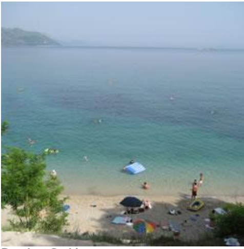
Beach at Orebic