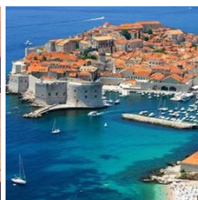
Dubrovnik old town