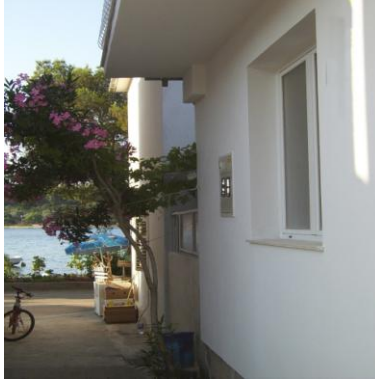
Front of Villa-view to the sea