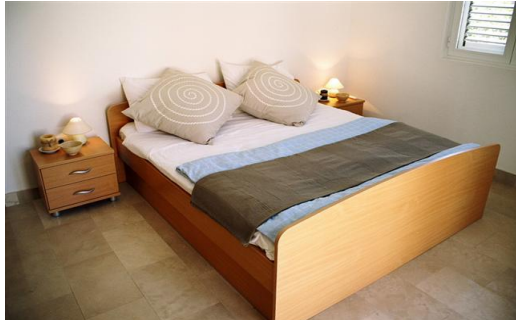
Bedroom 1 (with seaview balcony)