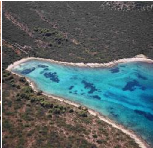
Cove around the bay – hire a boat!