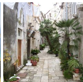
Nearby old town street