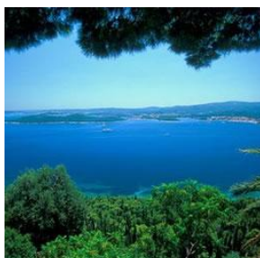
View to Korcula Island