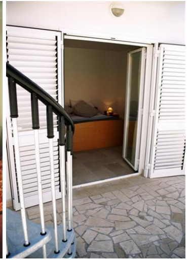
Steps to Roof Terrace