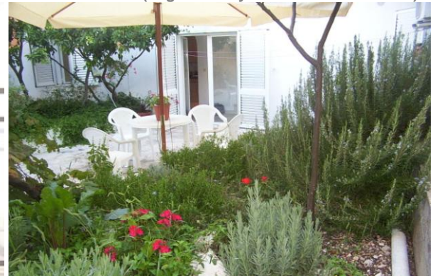
Courtyard Garden full of herbs