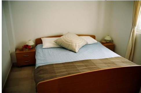
Bedroom 2 (Ground floor)