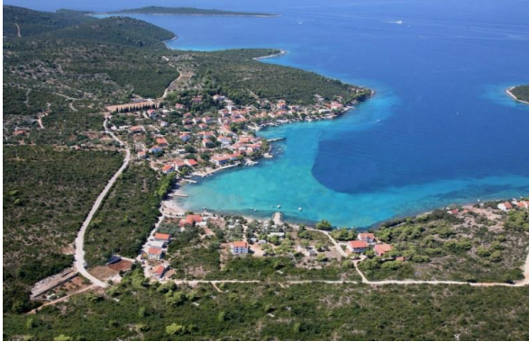
Aerial view of the village-house is 50m from jetty!

Sleeps 6 + 2 | 3 Double Bedrooms plus Sofa bed | 2 Bathrooms