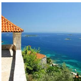
View from local Monastery