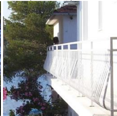
First Floor Balcony