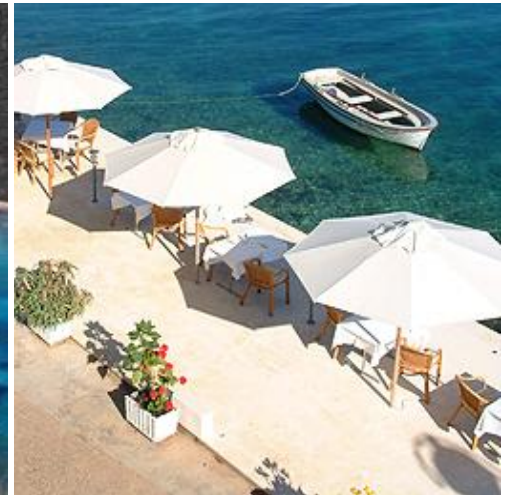
Garden at the villa