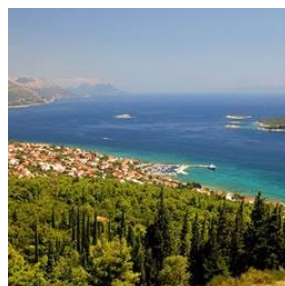
View across peninsula