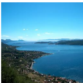
View down the peninsula