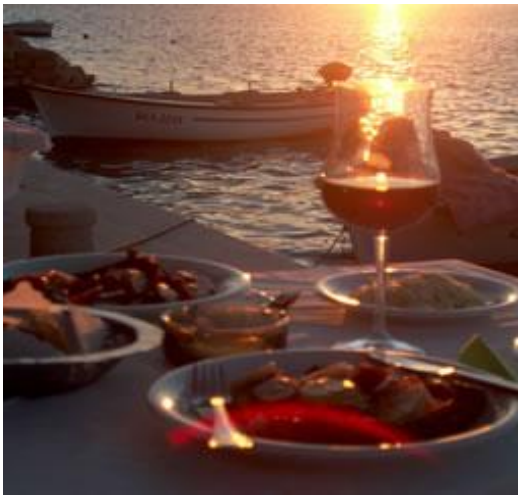
Dinner in the village!

Internally, the villa comprises 3 double bedrooms (2 upstairs and 1 down). A King sized sofa bed is also available in the living room. Both upstairs bedrooms both have balconies from which you can see the sea while the downstairs bedroom looks out onto the pretty courtyard garden. The property also boasts of a fantastic roof terrace but the private garden benefits from shade, especially in the evening when it is the perfect place to escape from the heat of the day.