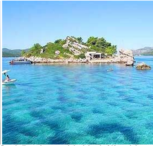
Snorkeling trip around the Island of Korcula!