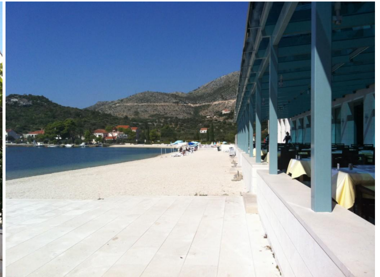
The Admiral Hotel Sea Edge Restaurant and Beach