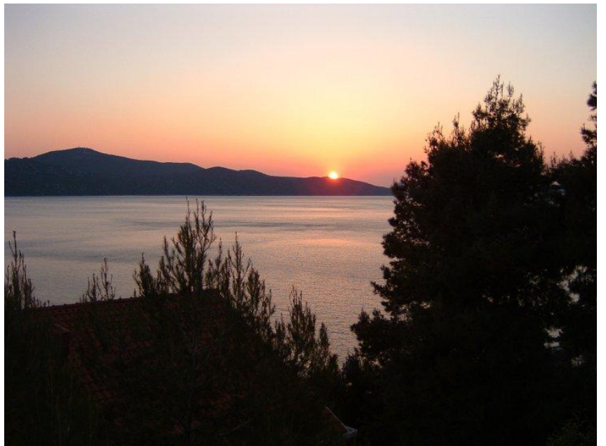
Stunning Slano Bay – There are many coves and calm bays to swim in and the sunsets are beautiful