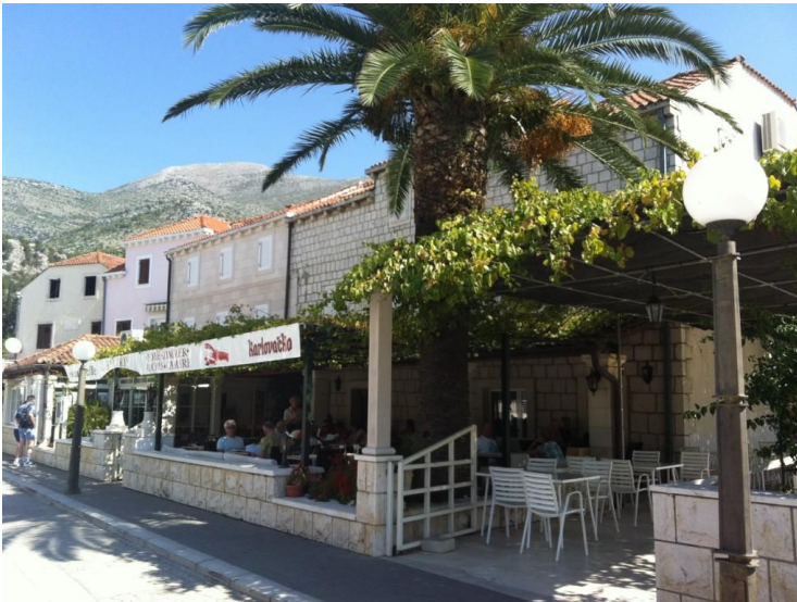
Slano Bay Restaurant – serving traditional Dalmatian food!