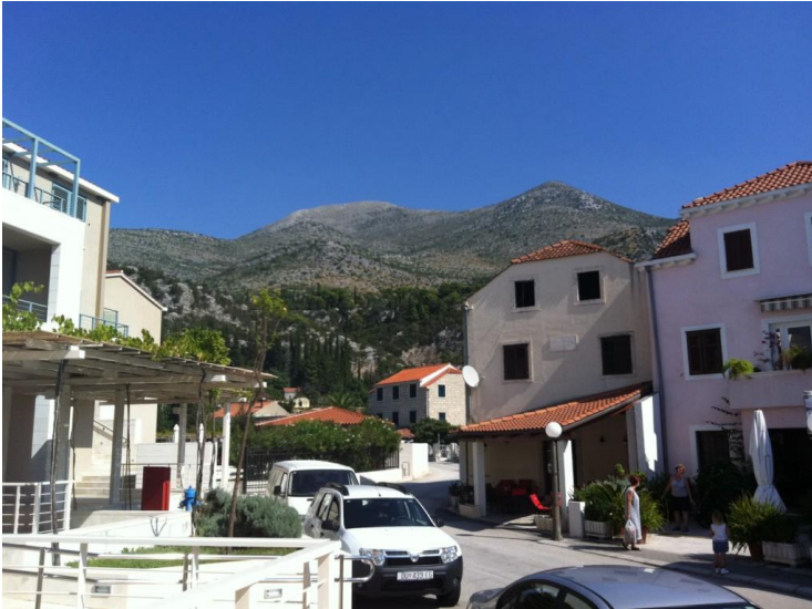
Slano Bay – in the village