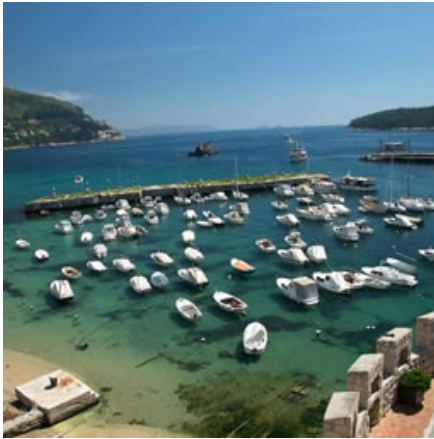
Old town harbour