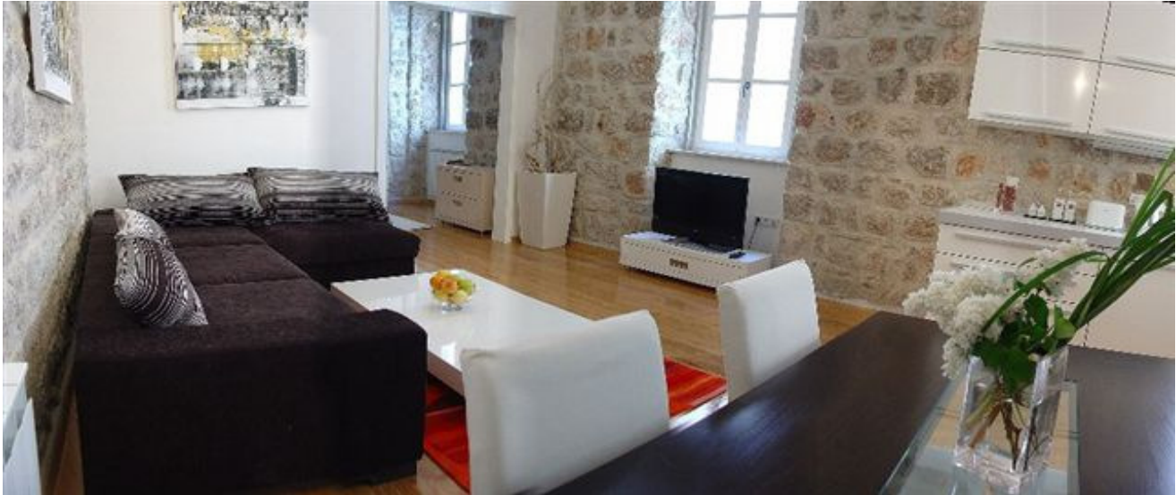
Kitchen with living area