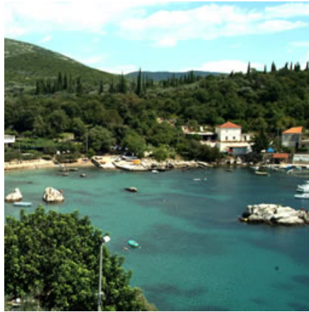
Nearby fishing village