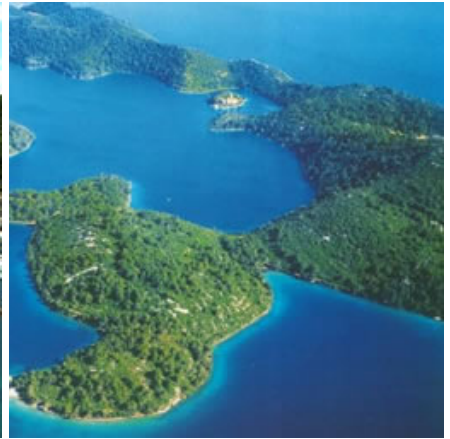
Island of Mljet (National Park)

Everything is 5 - 10 minutes away from Villa Stradun. This includes restaurants, cafés, night clubs, Old Town Port (from where boats depart for nearby islands and towns), souvenir shops, grocery stores and boutiques. Indeed, if you are aiming to see as much as possible of this town and looking to enjoy the long hot summer nights of Dubrovnik, you have come to the right place.