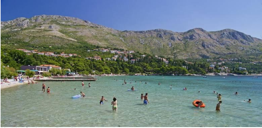
Nearby Srebreno Beach