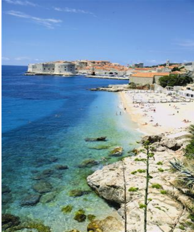
Dubrovnik Old Town