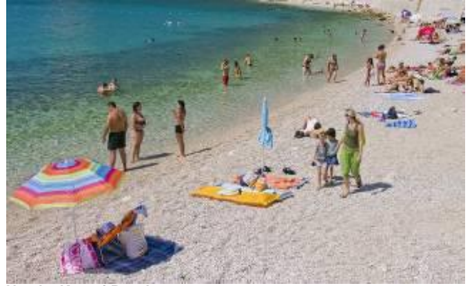
Nearby Kupari Beach