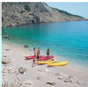
Sea Kayaking to nearby islands