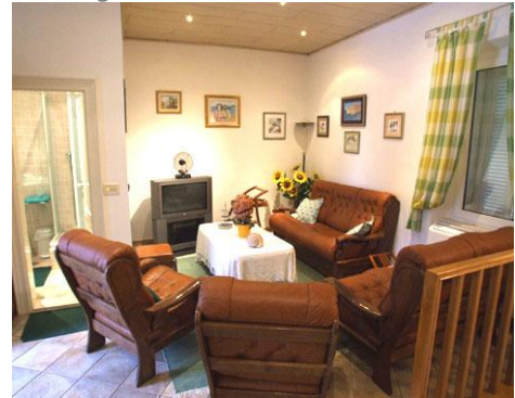
Lounge area with cable TV and Hi Fi