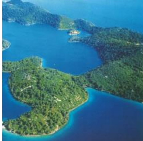
Island of Mljet (day trip from Dubrovnik)