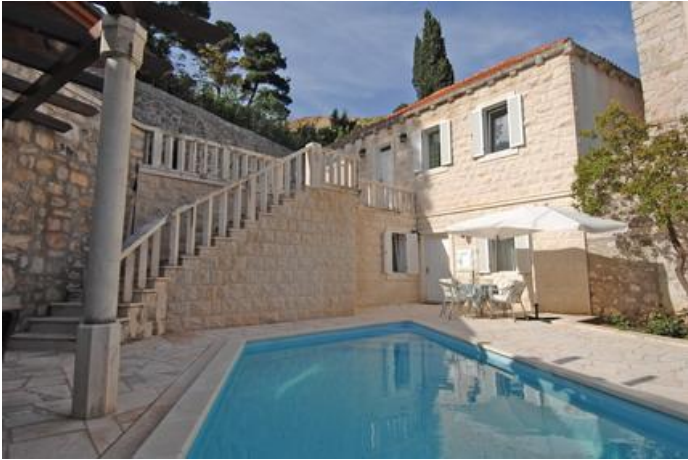
View of the villa from the pool

Sleeps 8 + 2 | 4 Bedrooms | 1 x Double Sofabed