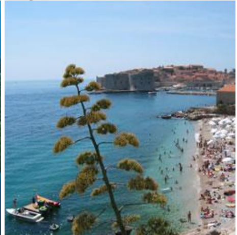
Old Town Beach