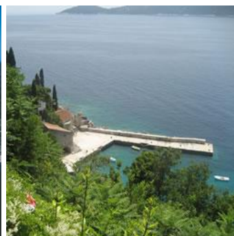
Beautiful Botanical Gardens