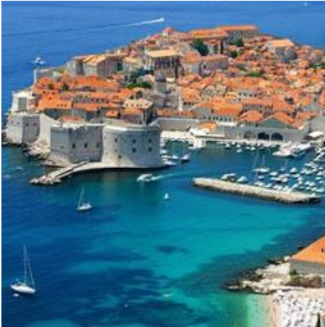
Old Town of Dubrovnik