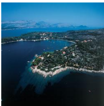
Island of Kolocep 20 mins away!