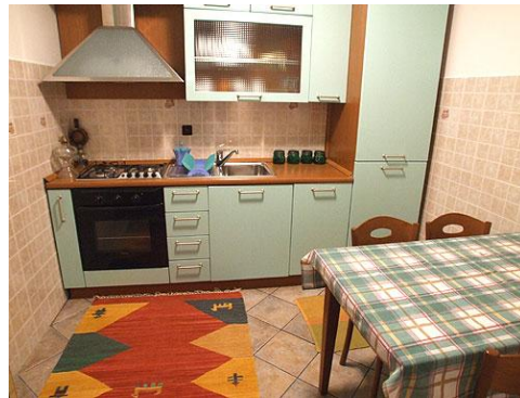
There are two fully equipped kitchens