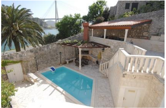
Terrace view to Dubrovnik bridge and River Ombla Delta